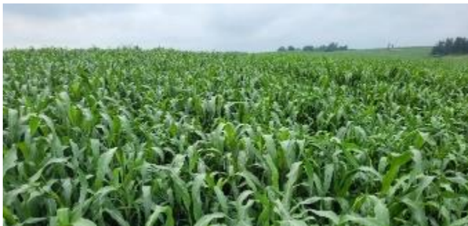
Picture 2. Cocktail forage mix prior to first harvest.

harvests (3.7 tons DM/acre total). If sandy soil is present, including a warm-season annual grass may be useful to improve growth.